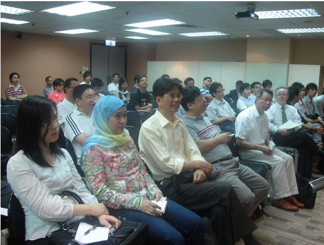
The debriefing seminar was well attended by members.